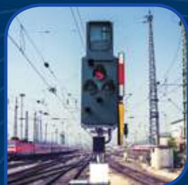
1 Trackside traffic control box Signal lights box