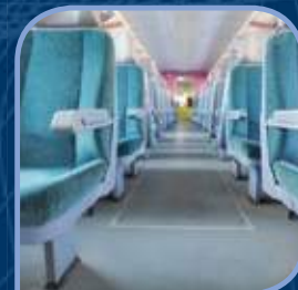
3 Floor coverings