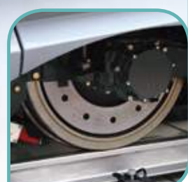
6 Brake system