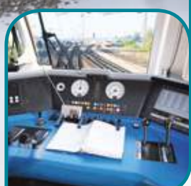
5 Driving cabin