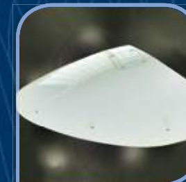
3 Air dam