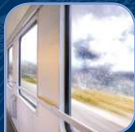
3 5 Window