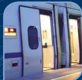
3 Outer/inner door