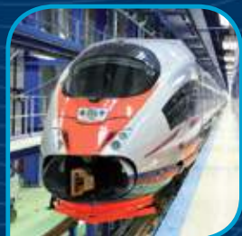
2 Carriage structure